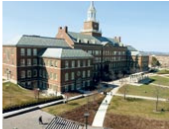
A view of the campus of the University of Cincinnati